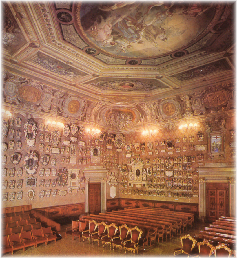
Aula Magna, Palazzo del Bò